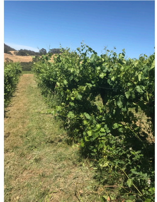
Block 8 Pinot some dense crowns, watershoots, undervine weeds including blackberry, thistle, midrows slashed