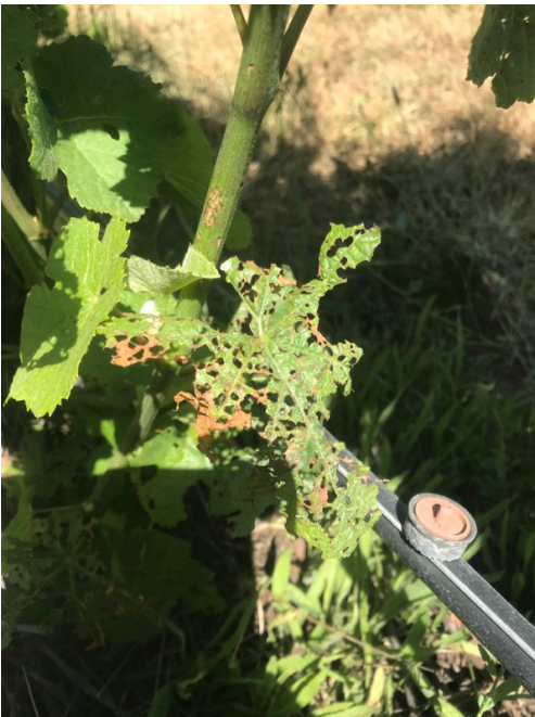
Block 8 weevil damage? (Not sighted)