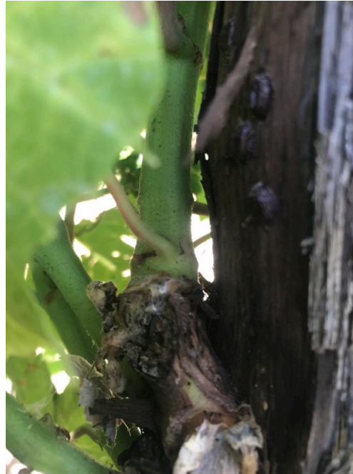
Scale block 9 Pinot