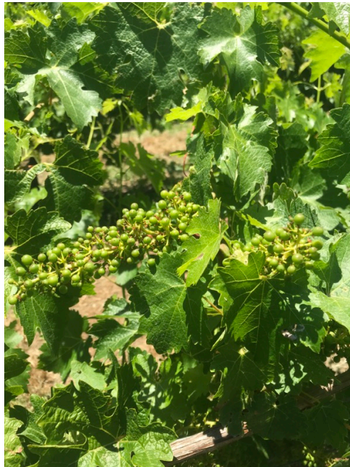
Good bunches on healthy shoots block 2 Cabernet