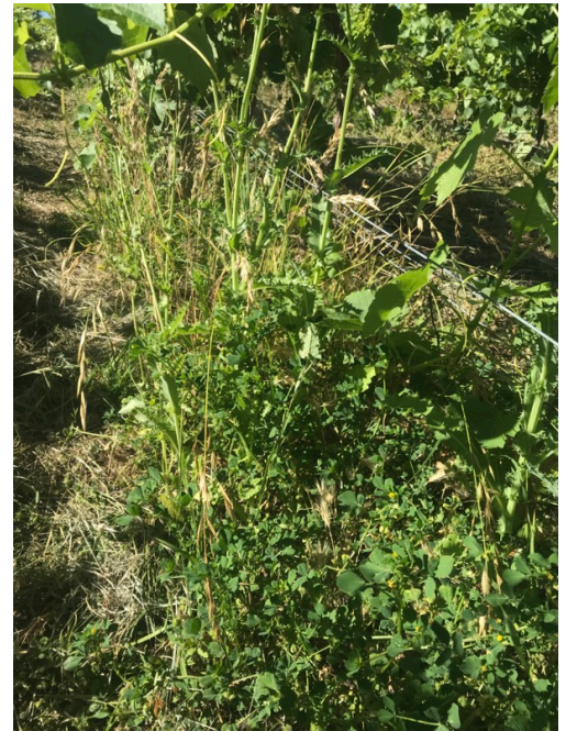
Block 5 undervine medic weed & thistle