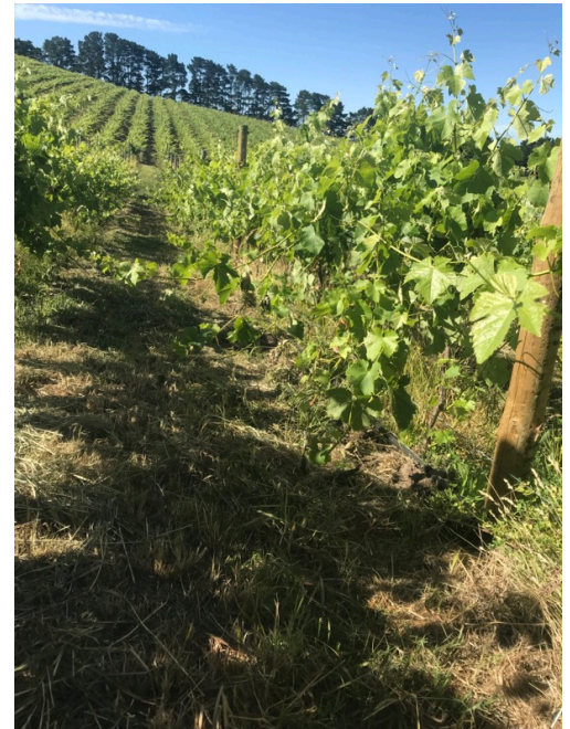
Block 5 Shiraz canopy needs lifting, some watershoots, undervine weeds, midrows slashed.