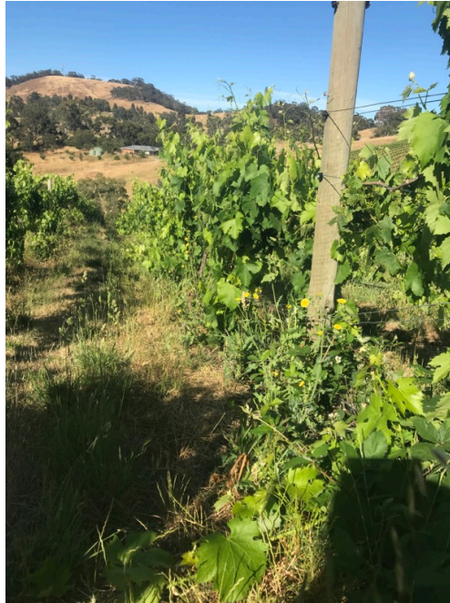
Block 3 Sangiovese some dense crowns, watershoots, undervine weeds including blackberry, thistle.