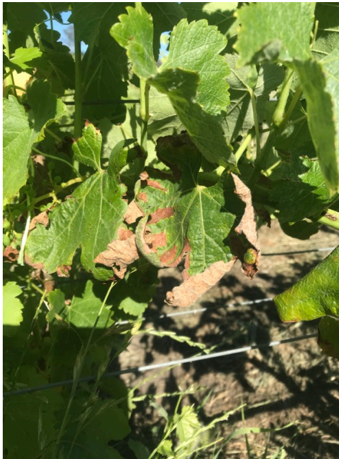
5a Shiraz deficiency/toxicity (salt?) symptoms