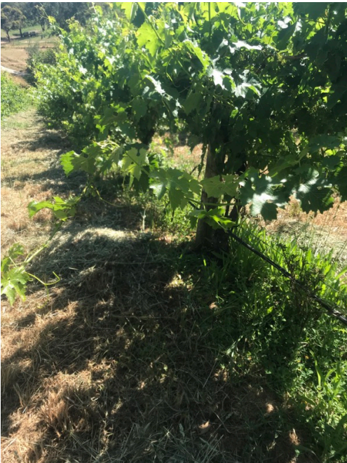
Block 2 Cabernet some dense crowns, watershoots, undervine weeds including blackberry, and nightshade