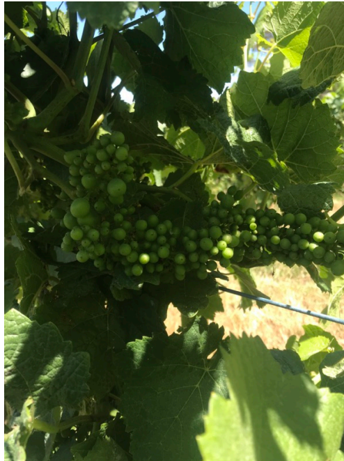
Good bunch on healthy shoot block 8 Pinot