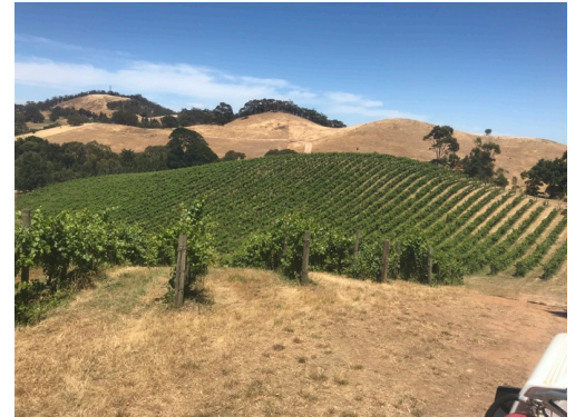
Looking over block 8 Pinot to block 9 Pinot