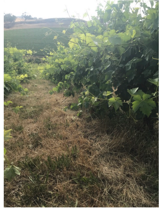
Block 4B Shiraz some dense crowns, heavy watershoots, undervine grass and broadleaf, midrows slashed.