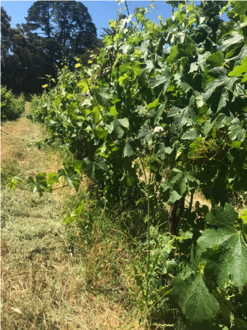
Block 1 Merlot some dense crowns, heavy watershoots, undervine grass and broadleaf including sow thistle, midrows slashed.