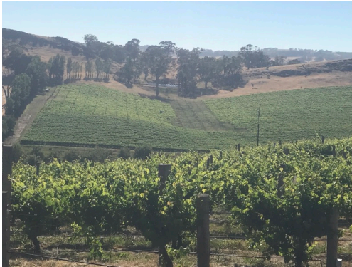
Looking over block 2 Cabernet to block 5 Sauvignon Blanc and Shiraz

Generally good growth with a medium spread of medium size bunches. Some dense canopy would benefit from thinning/trimming/hedging/leaf plucking. Some scale, snails, grasshoppers and earwigs sighted but there are no urgent pest and disease issues.