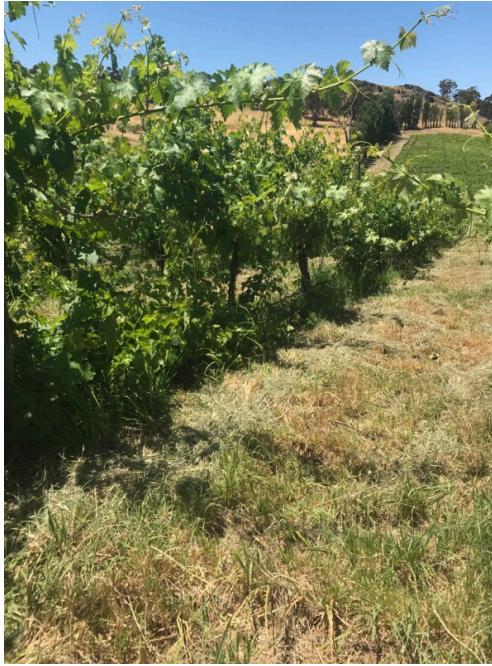
Block 4A Cabernet some dense watershoots, undervine weeds, slashed midrows.