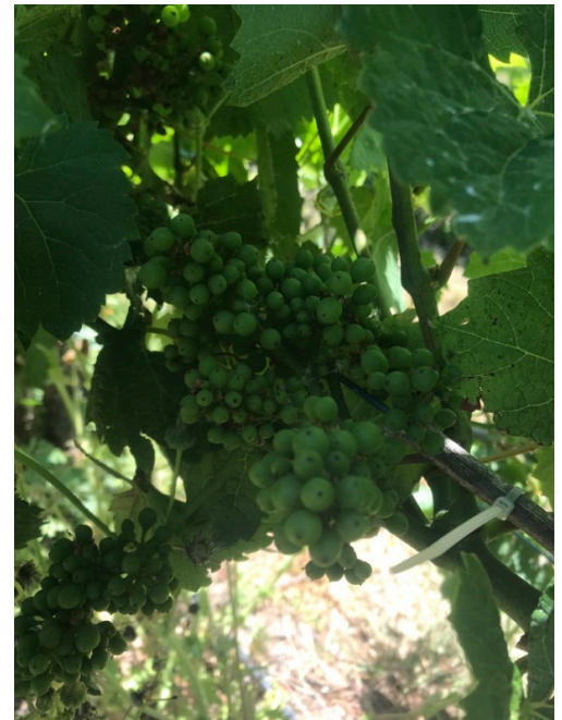
Block 7 Pinot some good bunches on healthy shoots