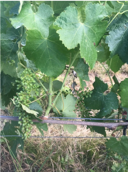
Block 4B Shiraz good bunches on a healthy shoot.