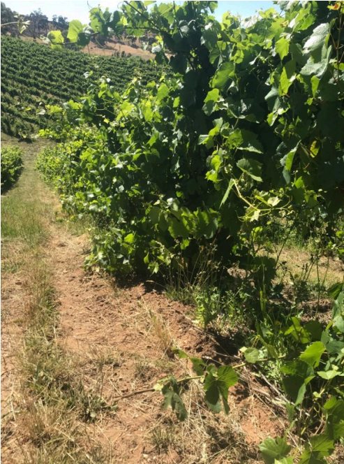
Block 9 Pinot some dense crowns, heavy watershoots, undervine weeds, midrows slashed