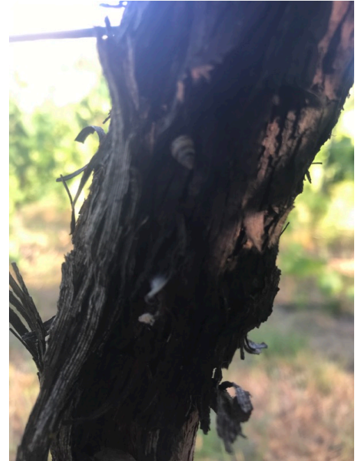
Pointed snail block 3