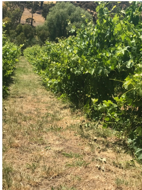
Block 6 Merlot dense canopy, dense watershoots, some undervine weeds including thistle, midrows slashed.