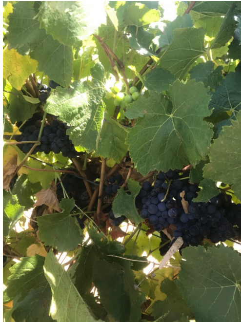
Pinot block 8 bunch zone, some secondary crop.