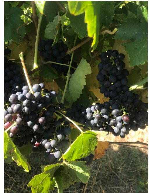
4B Shiraz bunch zone