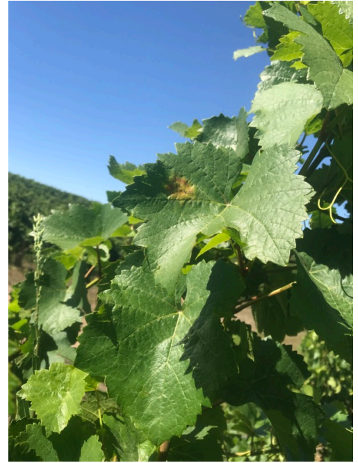
Downy Mildew block 9 only very slightly active