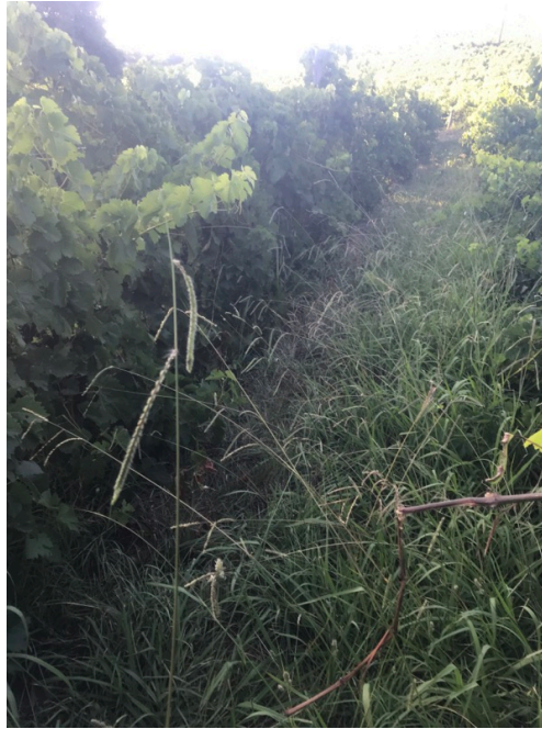
Block 1 Merlot some dense canopy lightened by trimming, some watershoots, heavy undervine weed growth, midrow sward to 50 cm.