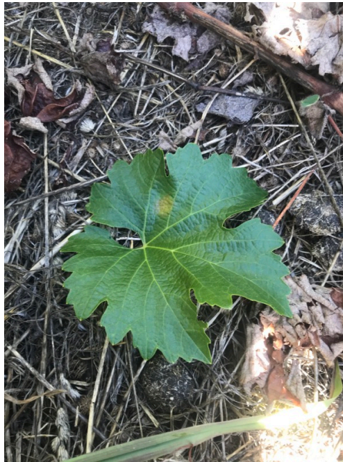
Downy Mildew block 4A Cabernet slightly active