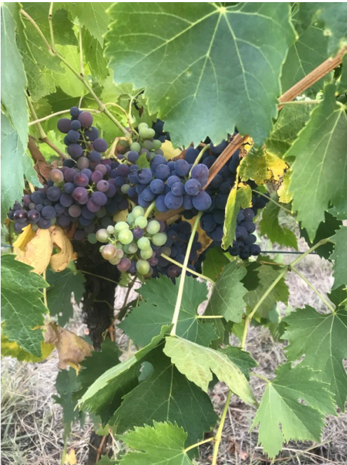
Block 3 bunch zone