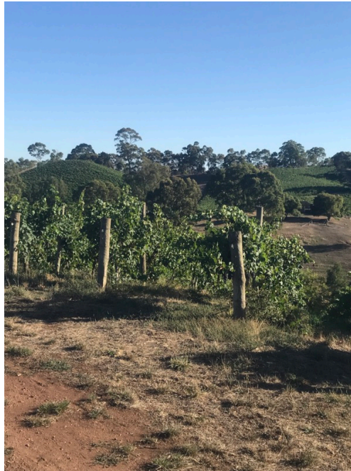
Looking over block 2 to blocks 7,8,9.