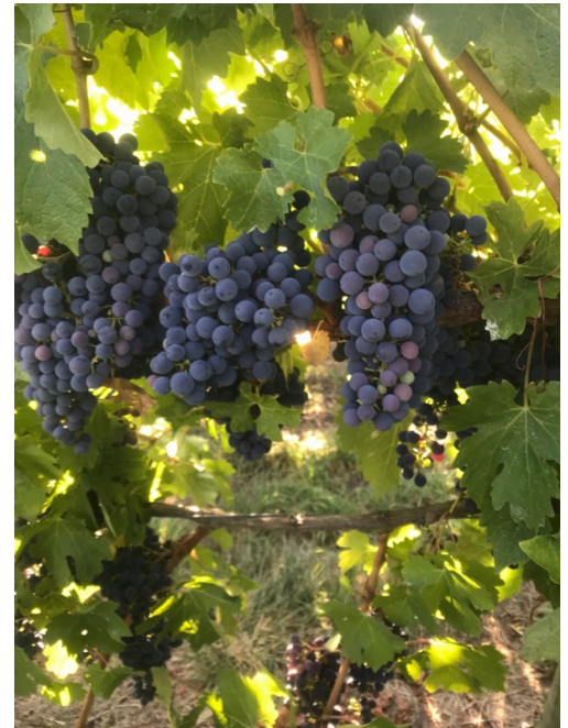
Bl 2 Cabernet bunch zone