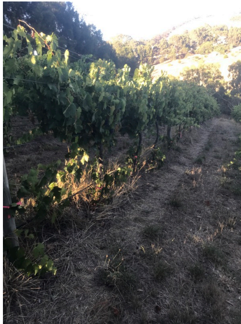
Block 3 light canopy, watershoots flagged/removed, some undervine weeds including blackberry, light midrow sward.