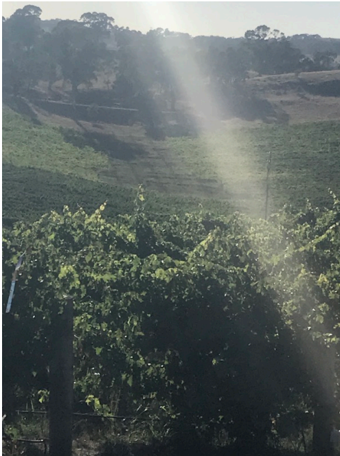
Looking over block 4 to block 5

All varieties are well into veraison with generally a light to medium density of small to medium bunches. Some hen and chicken in the Pinot and some secondary crop will impact yield and evenness of ripening. Some active Downy Mildew, mostly in the tips, not spreading into the resistant covered canopy.