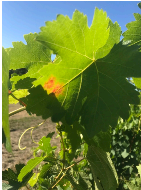
Slightly active Downy Mildew block 4b