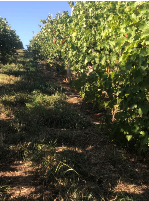
Block 2 Cabernet fairly light canopy, some heavy watershoot growth, some dense undervine weeds including blackberry.