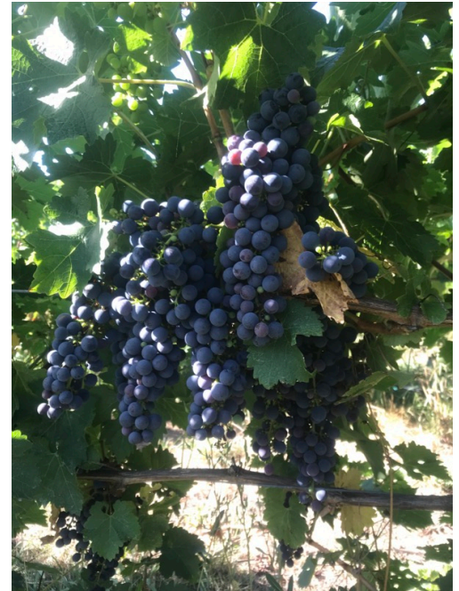
Block 4A Cabernet bunch zone