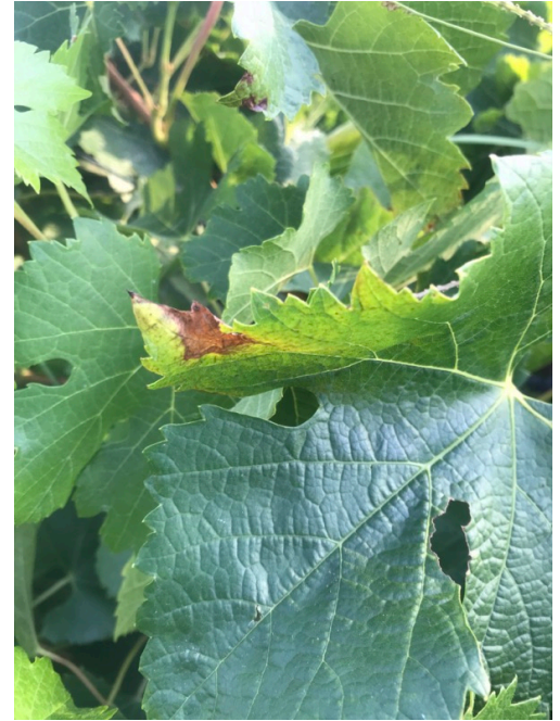
Bl 3 Sangiovese Downy Mildew slightly active