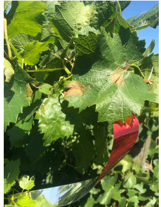
Downy Mildew block 7 Pinot slightly active