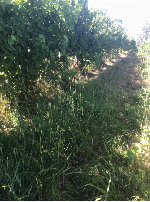
Block 5a Sauvignon Blanc some dense canopy, some heavy watershoot growth, undervine grass, light midrow sward.