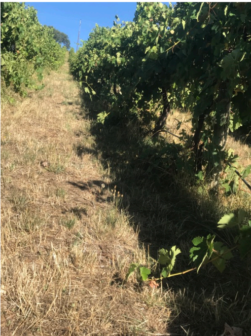
Block 4b Shiraz dense canopy lightened by trimming, some heavy watershoot growth, some heavy undervine weeds including blackberry, light midrow sward.