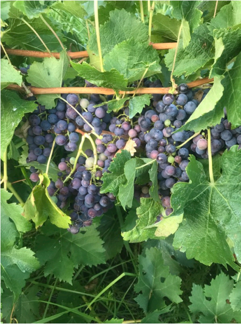
Bl 1 Merlot bunch zone