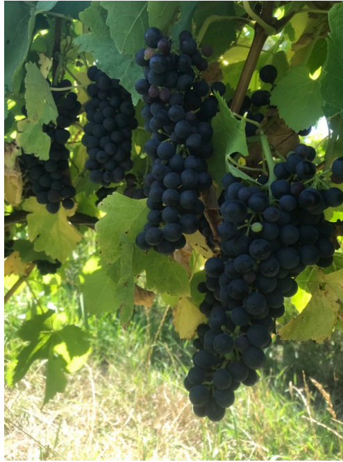
5b Shiraz bunch zone