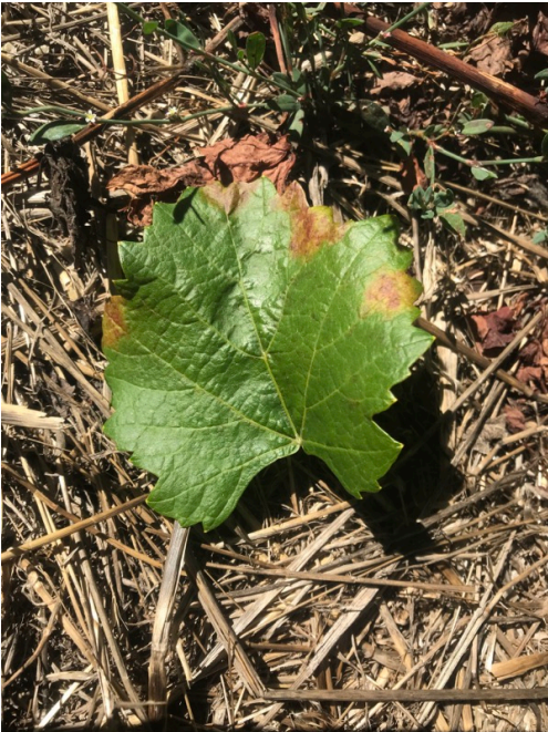
Downy Mildew block 8 slightly active