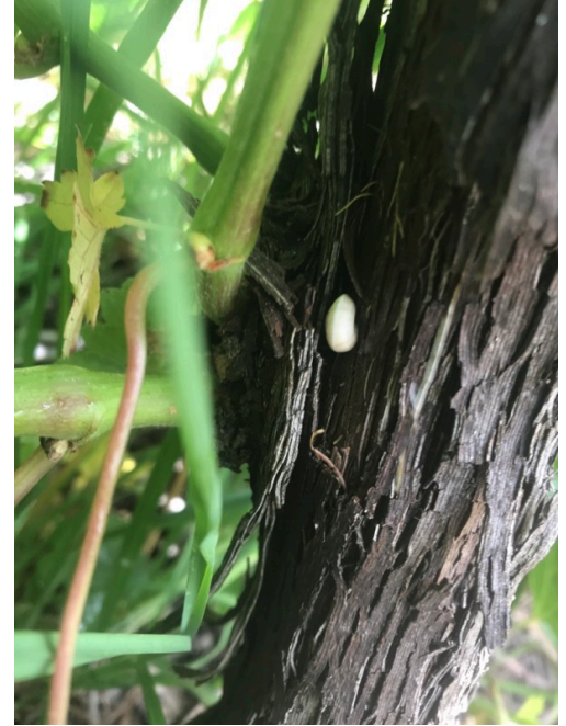
Merlot 1 common white snail