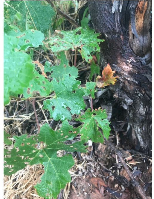
Weevil damage? block 2 Cabernet (not sighted)