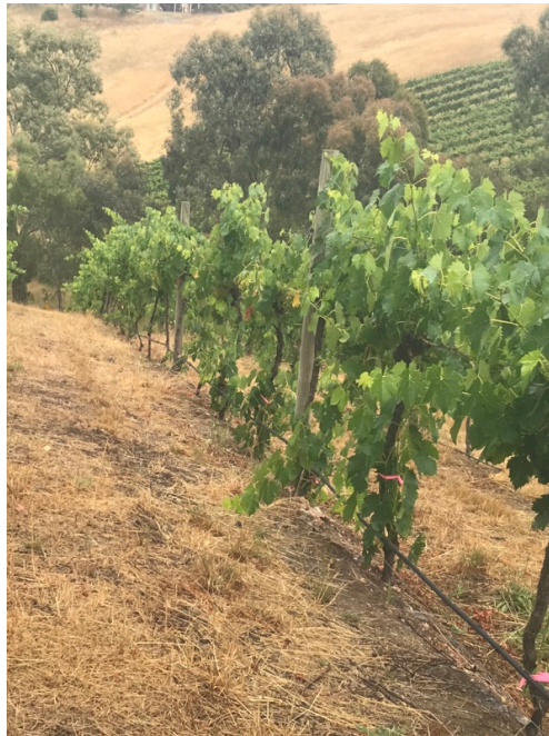
Block 2 Sangiovese watershoots flagged/removed, fairly clean undervine, midrows slashed.