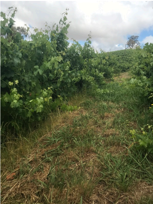
Merlot 1 some some dense crowns, heavy watershoot growth, undervine weeds, midrows slashed.