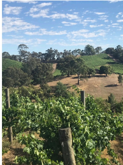
Looking over block 2 Cabernet to blocks 8 and 9