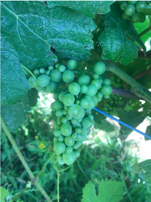
Block 7 Pinot some hen and chicken