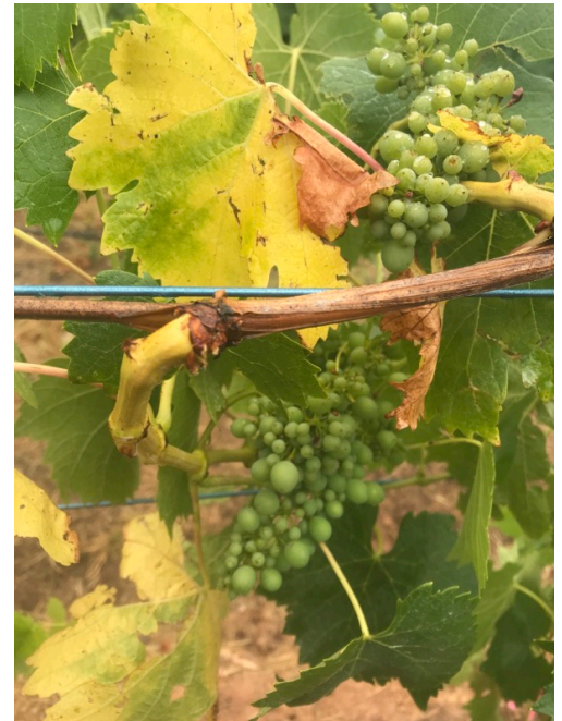
Sangiovese bunches some hen and chicken