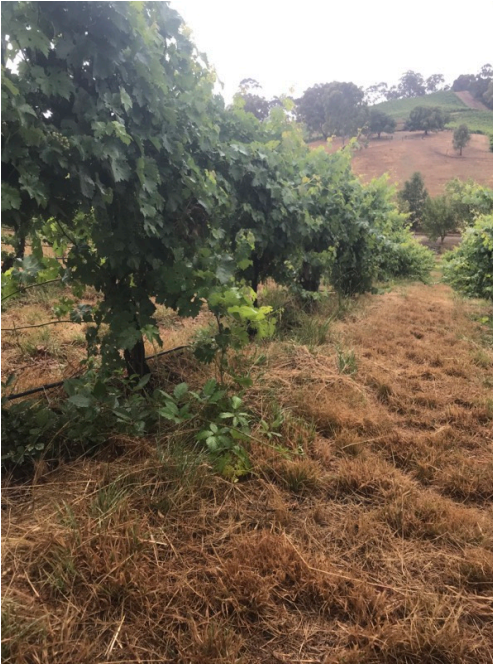
Block 2 Cabernet some dense crowns, heavy watershoot growth, undervine weeds including blackberry, midrows slashed.