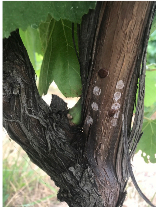
Scale block 4b Shiraz