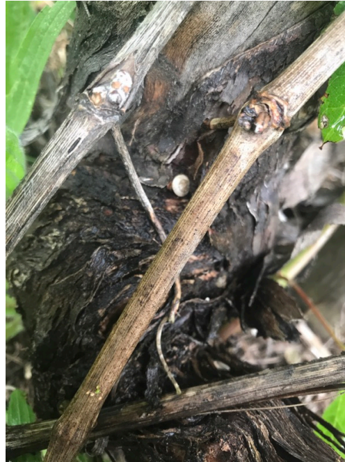
Common White Snail block 2 Cabernet