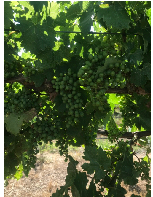
Block 2 Cabernet fruit zone.