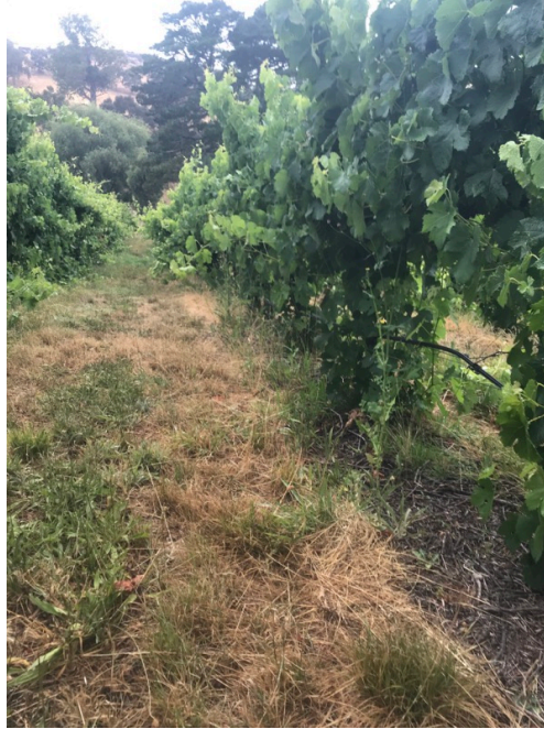
Merlot 6 some dense crowns, heavy watershoot growth, fairly clean undervine, some thistle, midrows slashed.