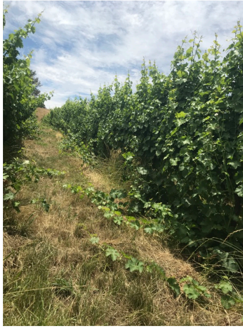
Block 4A Sauvignon Blanc some dense canopy and crowns, watershoot, undervine weeds, midrows slashed