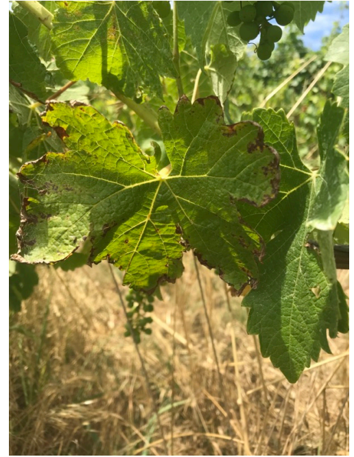
Block 5b Shiraz deficiency/toxicity symptoms? Salt?