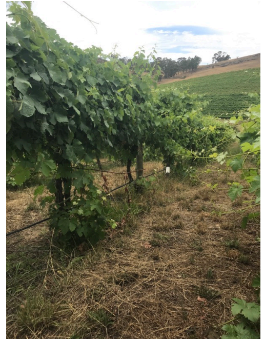
Block 4b Shiraz some dense crowns, watershoots, undervine weeds, midrows slashed.