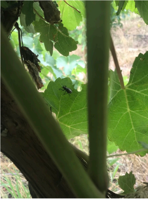
Weevil block 4b Shiraz