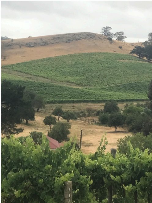
Looking over block 6 Merlot to block 5

Generally good fruitset with a medium density of medium size bunches. Some hen and chicken in the Pinot. Some dense canopies and crowns would benefit from leaf plucking/trimming/hedging. Some weevils, scale and common white snails sighted but no urgent pest and disease issues.