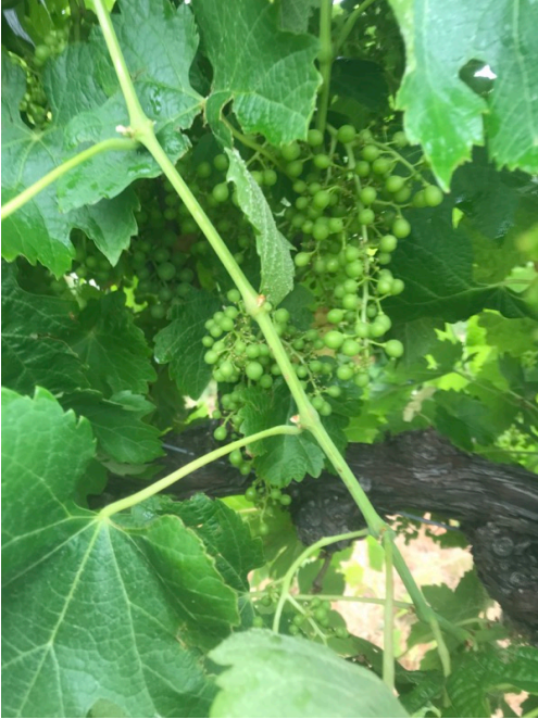
Merlot 6 fruit zone