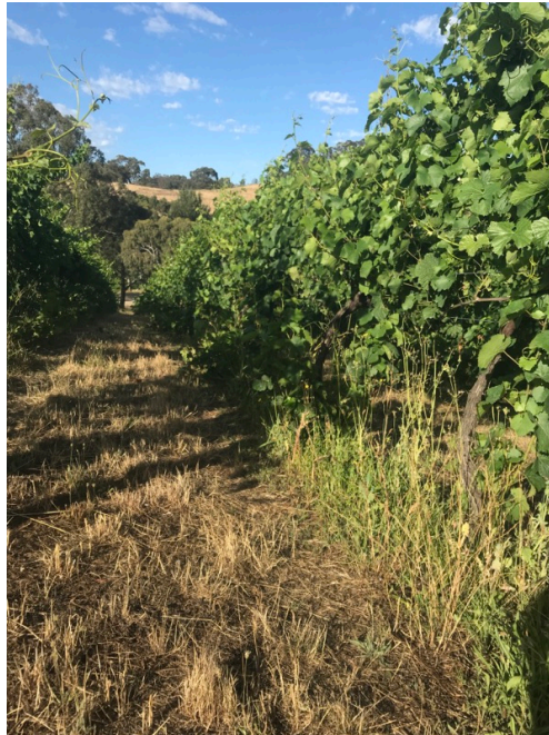
Block 8 Pinot some dense crowns, undervine weeds, heavy watershoot growth, midrows slashed.