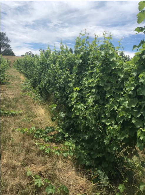
Weevil damage block 4b Shiraz (not sighted)